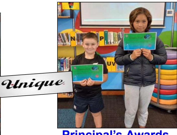
Principal's Awards -