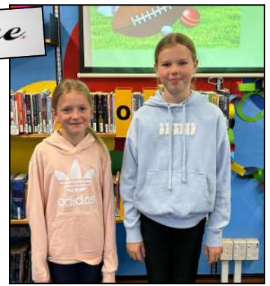
Players of the Day