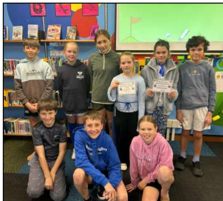
CBOP Squash Tournament Competitors Player of the Day - Hockey