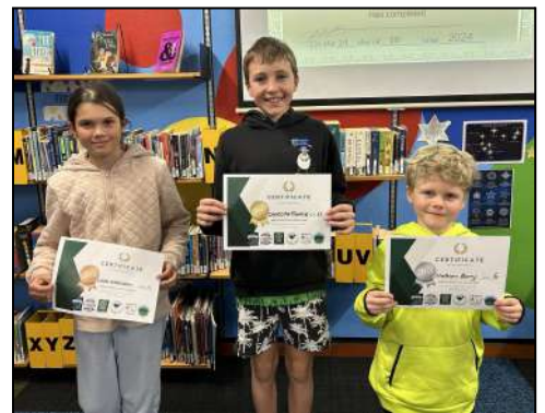
Cluster Cross Country Placegetters