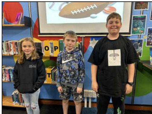
Players of the Day