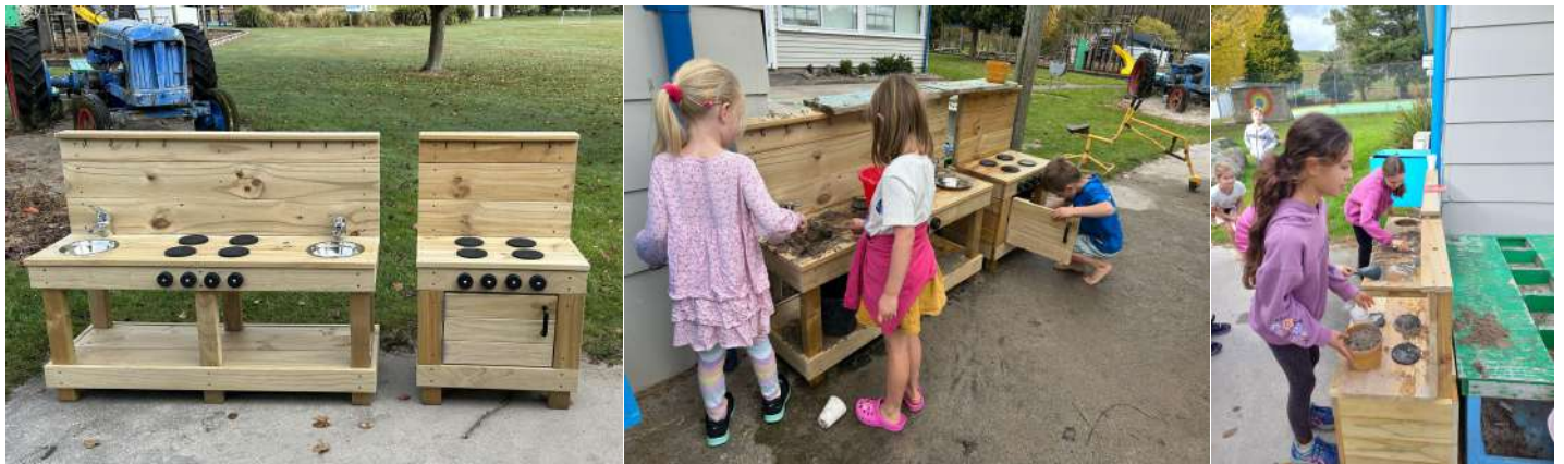
OUR NEW MUD KITCHEN